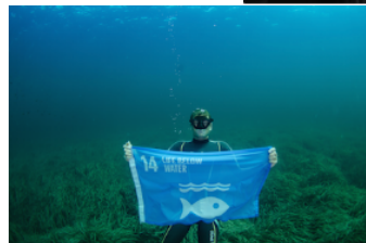
Pictures: Pandas help raise the flag in China, a school in Thailand takes part in the Worlds Largest Lesson, Naomi Campbell lends her support, flag is raised underwater and projections light up the UN headquarters